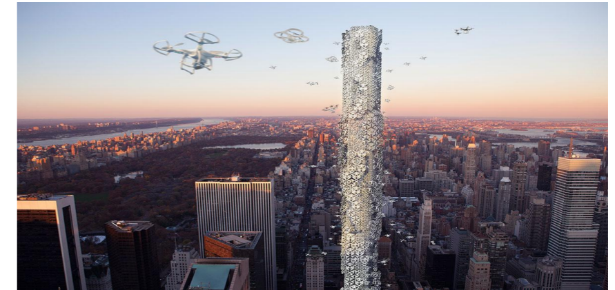
New york city in the future. Extracted from eVolo Magazine 2016 Skyscraper Competition, Mohammad, Zhao & Zhu (2016). http://www.evolo.us/competition/the-hive-drone-skyscraper/

http://www.ecomp.poli.br/~wcci2018/submissions/#Importantdate